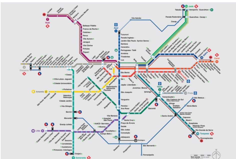
São Paulo subway lines map

http://bilheteunico.sptrans.com.br/cadastro.aspx